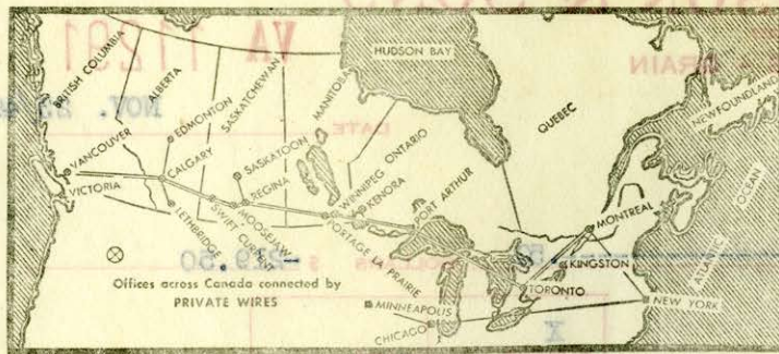
Offices across Canada connected by PRIVATE WIRES